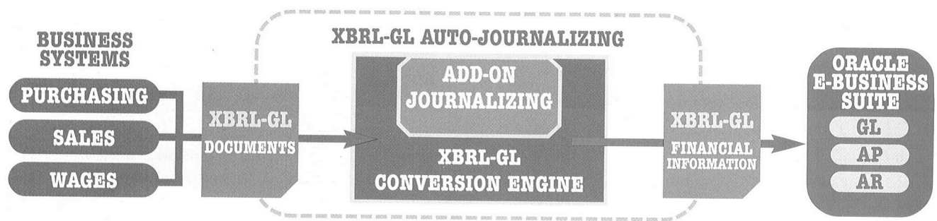
Figure 2: XBRL-GL AUTO-JOURNALIZING SYSTEM

convergence, and adoption of e-business standards. This consortium of tech firms is working with a United Nations organization to develop a common way for businesses to use XML to exchange data. (For more information on OASIS, visit www.oasis-open.org .)